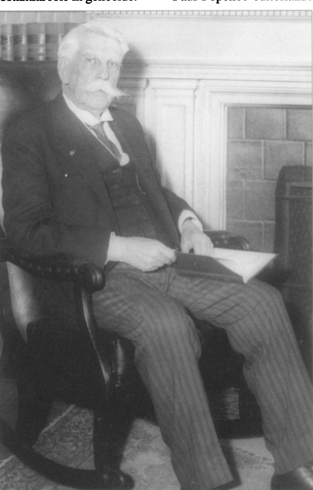
Oliver Wendell Holmes "Three generations of imbeciles is enough!"

the German law was not racist in origin and the legal safeguards in place would prevent any possible abuse. A few months later, American eugenicists greeted with joy the extension of the sterilization laws to cover "habitual criminals." American eugenicists admired the German system which, unlike the frustrating patchwork state-by-state system in the United States, enjoyed a strong central authority to guarantee the eugenic purity of the country. Further laws followed the sterilization law. In 1935 Hitler signed into law three measures often called the "Nuremberg Laws." These laws stripped non-Aryans of citizenship, prohibited the marriage of Jews and Aryans, and required all couples wishing to marry to submit to medical examinations to ensure the purity of the race. By 1939 the urge to purify the race would take another step beyond preventing the concep-