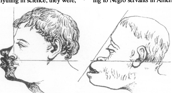
ner, then the scientist's work In the nineteenth century cranial measures were used to establish that Negroes also argued for a social prower at least two grades below Anglo-Saxons in ability and intelligence.

in principle, unknowable. However, the scientist could apply mathematics, in particular statistics, to scientific phenomena without actually committing to the existence of an underlying causal agent. In other words, if statistics showed that heredity worked in a particular manner, then the scientist's work was done.