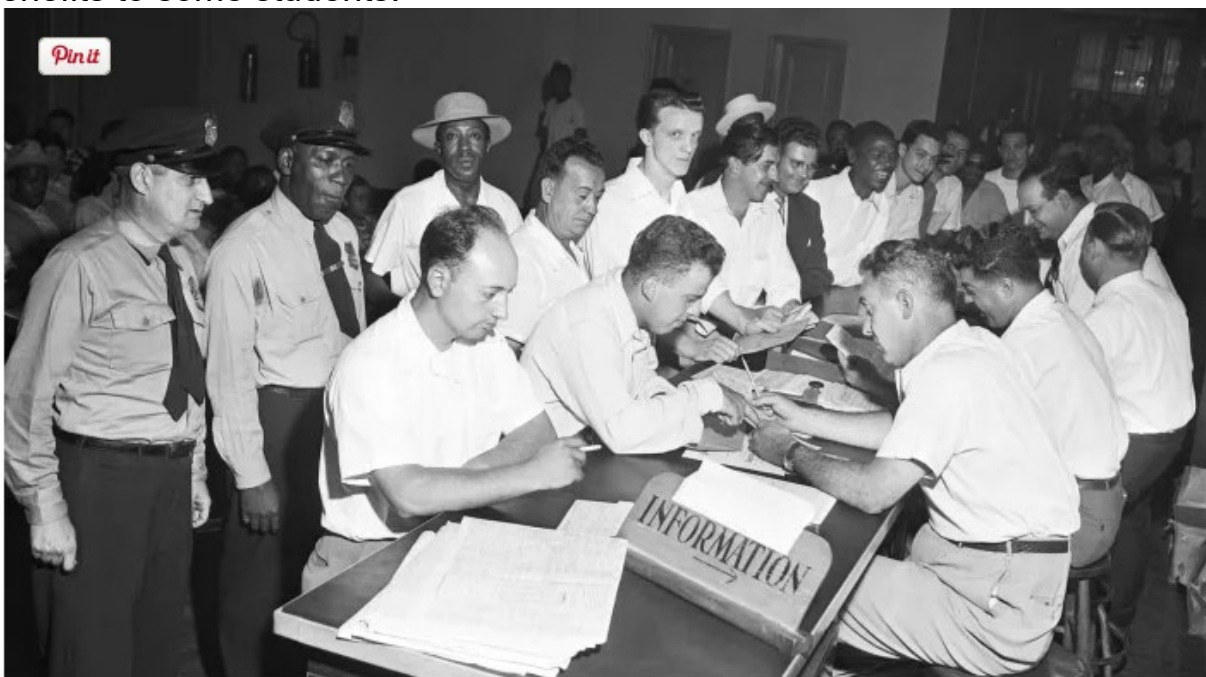
Veterans lining up for a last day rush to get counseling on GI bill educational courses at the New York regional office Veterans Administration on July 25, 1951.

As veteran applications flooded universities, Black students often found themselves left out. Northern universities dragged their feet when it came to admitting Black students, and Southern colleges barred Black students entirely. And the VA itself encouraged Black veterans to apply for vocational training instead of university admission and arbitrarily denied educational benefits to some students.