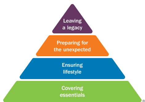
Confident Retirement ® approach

One of a series of papers on the Confident Retirement ® approach